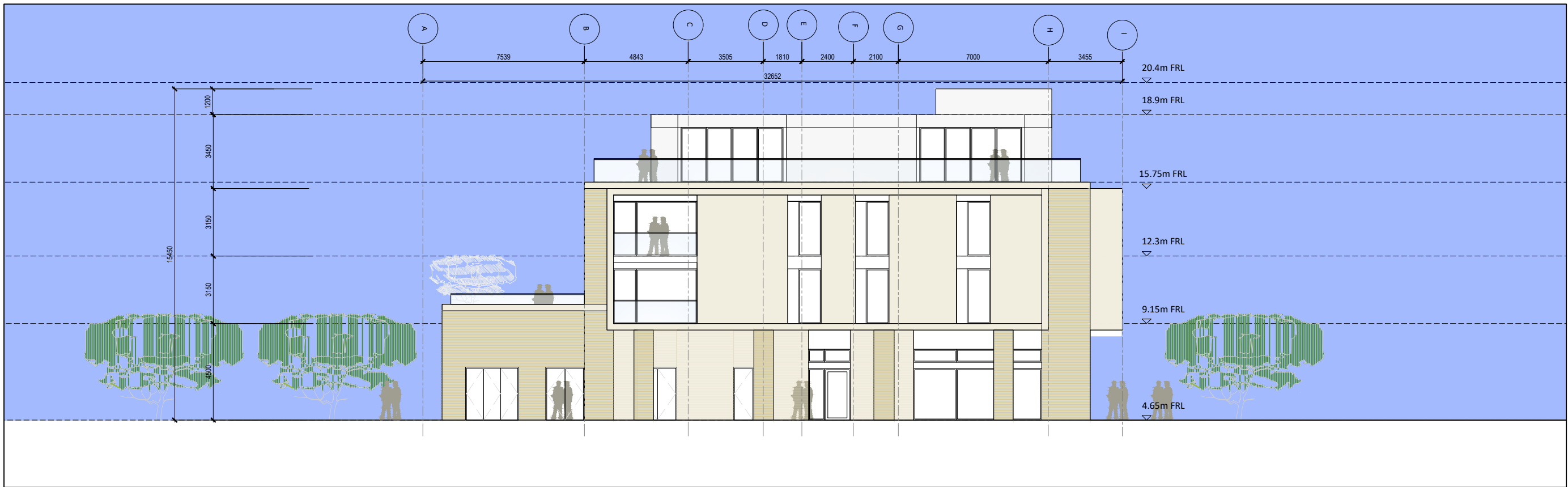
Block D South West Elevation to Marina (Strand Road Frontage)